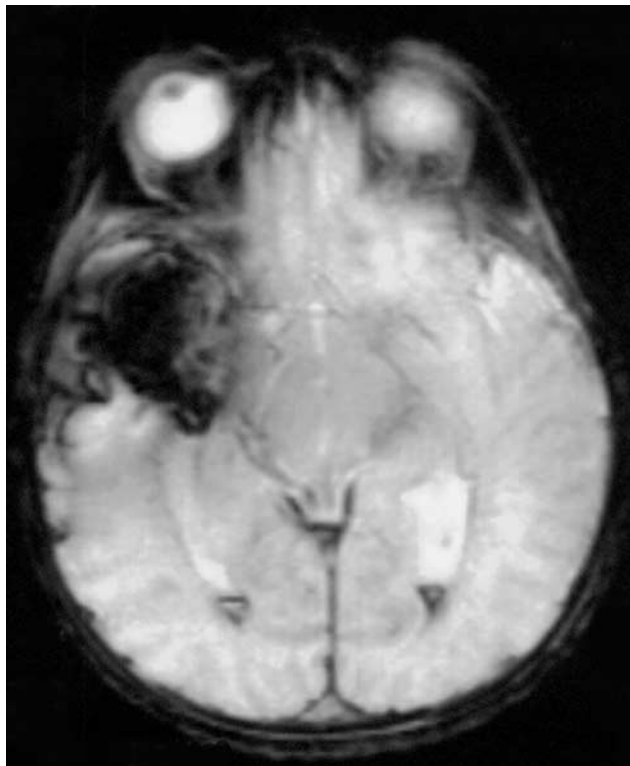
Figure 2. Gradient echo sequence of cranial MRI demonstrating right temporal lobe hemorrhage.

presenting with recurrent apnea. Conversely, because apnea is such a common event in premature neonates and usually a consequence of associated comorbidities of prematurity or a function of an immature respiratory drive, routine electroencephalographic monitoring of isolated apneic spells is not indicated in this population. 14 Although apneic seizures are commonly associated with other seizure types (e.g., clonic, tonic, hemiconvulsive) or with subtle clinical phenomena (e.g., eye opening, staring, eye movements, mouth movements), the absence of such associated phenomena should not dissuade the clinician from pursuing polygraphic monitoring with EEG. Furthermore, the suspicion of apneic seizures should be heightened in any full-term neonate when other causes of apnea (e.g. gastroesophageal reflux, pulmonary disease, cardiac arrhythmias) have been excluded. Thus, in the full-term neonate, apneic spells