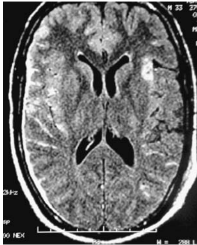
Fig. 1. Preoperative FLAIR-weighted MRI, showing a right sub-arachnoid hemorrhage due to the head injury (during the generalized seizure), and a small left anterior insular hematoma, consistent with the diagnosis of a CA which recently bled

Ojemann Cortical Stimulator, Radionics, Inc., Burlington, MA), allowing speech arrest during a counting task with an intensity of 5 mA.