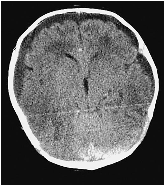
Fig. 1. Noncontrast head CT shows bilateral subdural collections, falcine subdural hematoma, and traumatic subarachnoid hemorrhage.