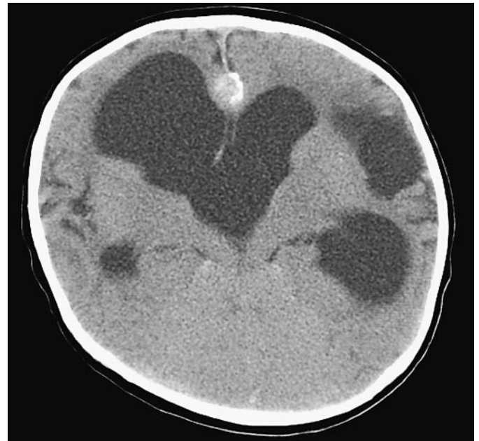
Fig. 2. Noncontrast CT demonstrates obstructive hydrocephalus.

raphy showed complete exclusion of the aneurysm from the vascular system, with good flow to the distal callosomarginal artery via collaterals. The patient tolerated the procedure well, and subsequently underwent an endoscopic third ventriculostomy for treatment of obstructive hydrocephalus (fig. 5). Follow-up MR and MR angiography scans showed a patent ventriculostomy, shrinking of the pseudoaneurysm, and no evidence of increased ventricular size.