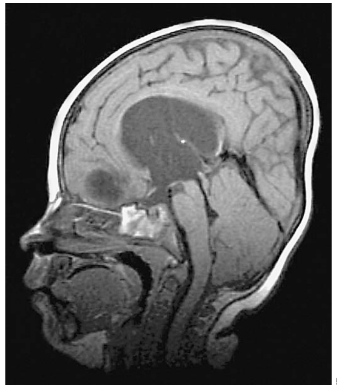
Fig. 5. Sagittal FSE MRI sequence demonstrates a hole in third ventricle floor after endoscopic third ventriculostomy.