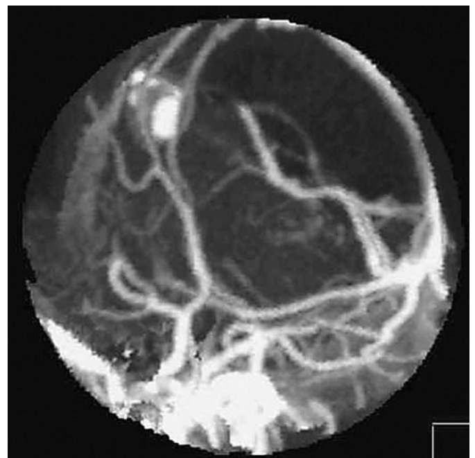
Fig. 3. CT angiogram with three-dimensional reconstruction of traumatic pericallosal aneurysm.

Traumatic arterial aneurysms comprise less than 1% of all intracranial aneurysms. However, 25–75% of traumatic aneurysms occur in patients 18 years or younger [1, 3, 5] and have been documented to develop in association with shaken baby syndrome [3]. These traumatic aneurysms of the pericallosal region are more distal than congenital aneurysms, which typically occur at the bifurcation of the pericallosal vessels [4]. Nakstad et al. [4] proposed that traumatic pericallosal artery aneurysms result from development of a false wall after a full-thickness vessel tear caused by shearing of the vessel against the falx.