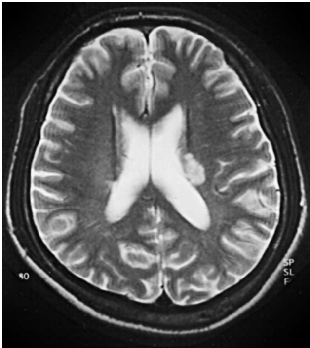
Fig. 1. T2-weighted brain MRI showing an infarction in the left corona radiata.

Levodopa treatment (100 mg, once daily before sleep) resulted in a moderate reduction in this movement. After a two-year follow-up period, his leg weakness was nearly improved, but involuntary leg movements persisted.