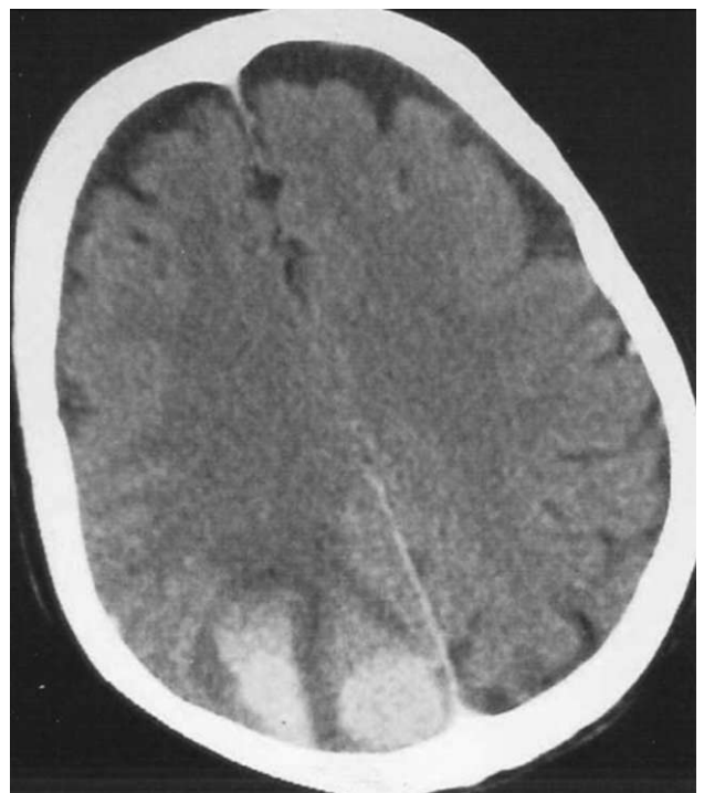
Fig. 1 Enhanced CT scan, showing a parasagittal homogenous high-density meningioma and a cortical parietal haematoma.

The histological type of meningioma has been reported to play an important role in the occurrence of haemorrhage. Several authors have suggested that the bleeding potential is higher in angioblastic and malignant meningiomas. 8,10,11 In cases of angioblastic meningioma the newly formed tumour vessels have thin walls, thus are fragile and bleed easily. For malignant meningiomas, the mechanism is assumed to be invasion of vessels, endothelial proliferation with weak vascular walls or obstruction of a vessel lumen leading to infarction, necrosis and bleeding. 1 Kohli and Crouch 8 through, reviewing 45 cases of spontaneous intracranial haemorrhage in meningiomas, indicated that the endotheliomatous type of meningioma accounted for the majority