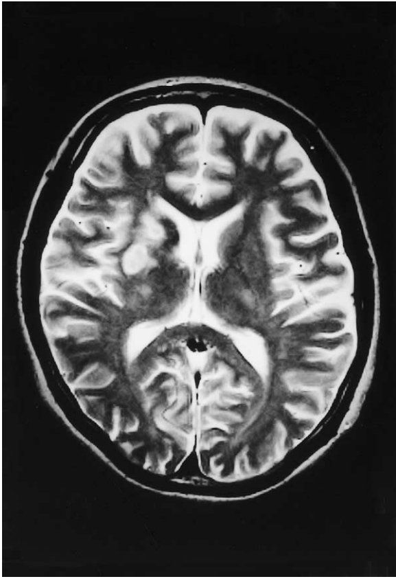
Fig. 2. T2-weighted magnetic resonance imaging on the sixth day. High-density and ring-shaped areas in the right caudate head and body and the putamen are shown.

ages, which seemed to change to slightly low-density areas. We thought that the severe dehydration caused by diabetic ketoacidosis induced ischemic brain infarction and the recovery modification from the dehydration induced hemorrhagic brain infarction at the right striatum. Magnetic resonance (MR) angiography was performed on the 19th hospital day. It showed a stenosis at the root of the bilateral middle and anterior cerebral arteries, but did not show a finding which supported a diagnosis of Moyamoya disease. Carotid artery echography and transesophageal echocardiography were performed on the 26th hospital day to clarify whether or not the hemorrhagic cerebral infarctions were induced by a thrombus and embolus. However, there were no remarkable findings. We did not support positively the anti-phospholipid antibody