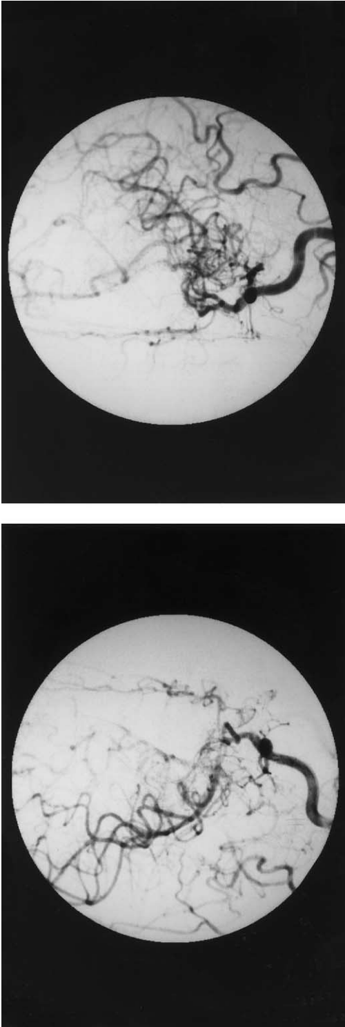
Fig. 4. Cerebral angiogram on the 20th hospital day at Osaka City General Hospital.

were no findings compatible to new hemorrhagic cerebral infarctions at the basal ganglia.