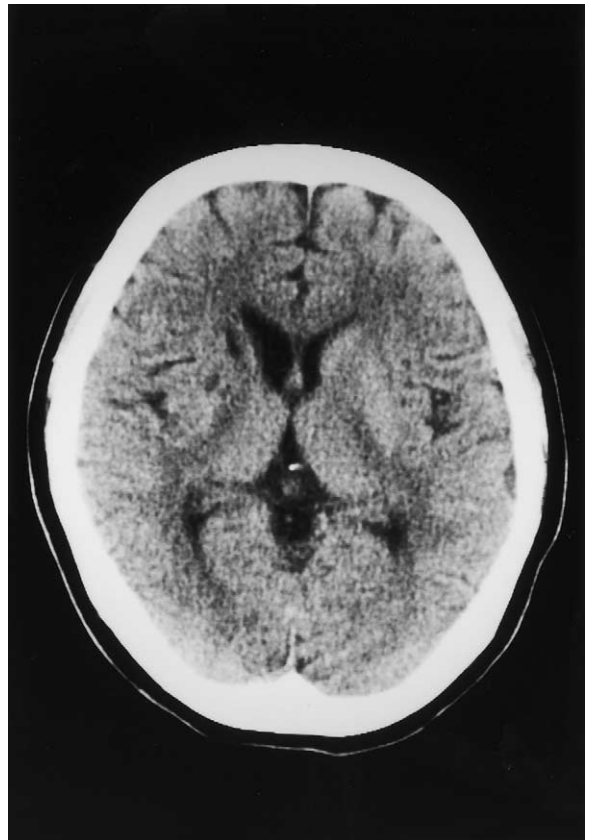
Fig. 3. Brain CT scan 9 months after discharge. The high-density area in the right caudate head on the admission had disappeared.

One year later, she was re-hospitalized because of the treatment of diabetic ketoacidosis induced by excessive drinking, which supposed to contain about 60 g of ethanol, and insulin omission. At this time, there was no hemichorea. However, unconsciousness was remained for 2 days after ketoacidosis disappeared. After the unconscious state, Broca aphasia was demonstrated for 15 days. Brain CT on this admission showed old cerebrovascular lesions. There