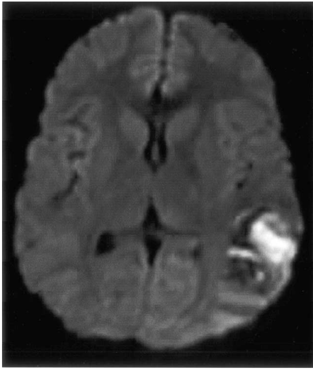
Figure 1. Diffusion-weighted magnetic resonance imaging depicts a hemorrhagic venous infarct in the left cerebral hemisphere.

1990s revealed that arterial ischemic strokes, often secondary to congenital heart disease, made up the majority (78%) of their cases [3]. Sinovenous thrombosis was less common (22%) in that series but historically may have been underdiagnosed before the routine use of magnetic resonance venography. The most extensive review of sinovenous thrombosis in children (160 cases) was the subject of a more recent publication by DeVeber and the Canadian group in 2001 [5].