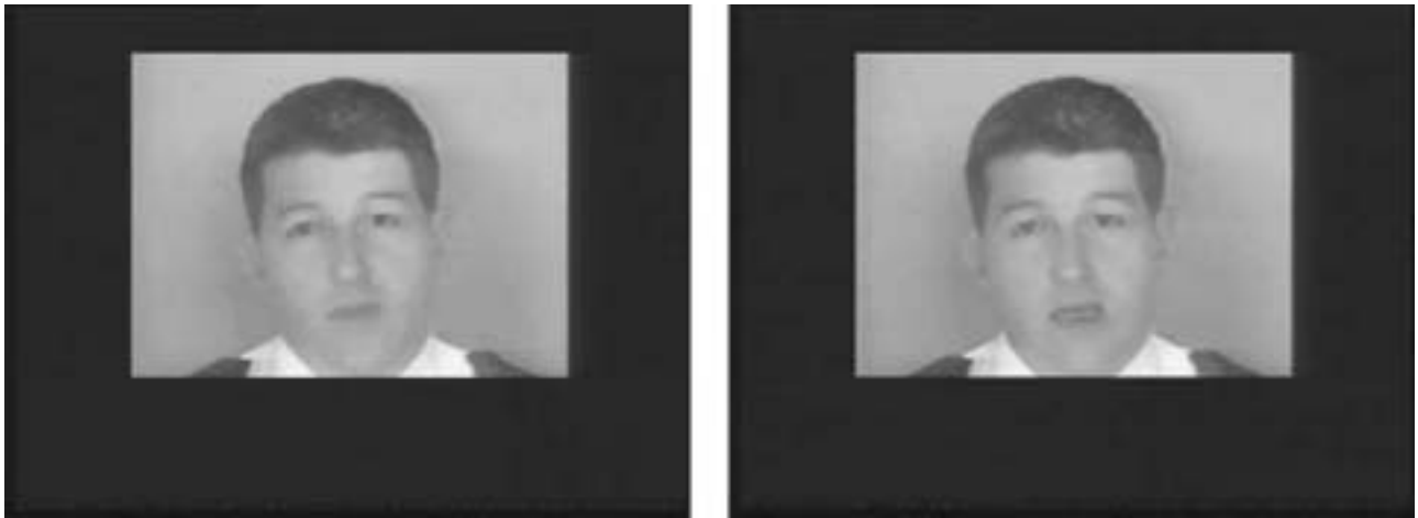
Fig. 1. Examples of the static images used for matching in Experiment 3.

static; static & non-rigid, rigid & rigid; rigid & static; static & rigid; static & static. Thus, there were seven conditions with 8 trials per condition, for both the same and different trials ( 7 \times 8 \times 2 = 112 trials).