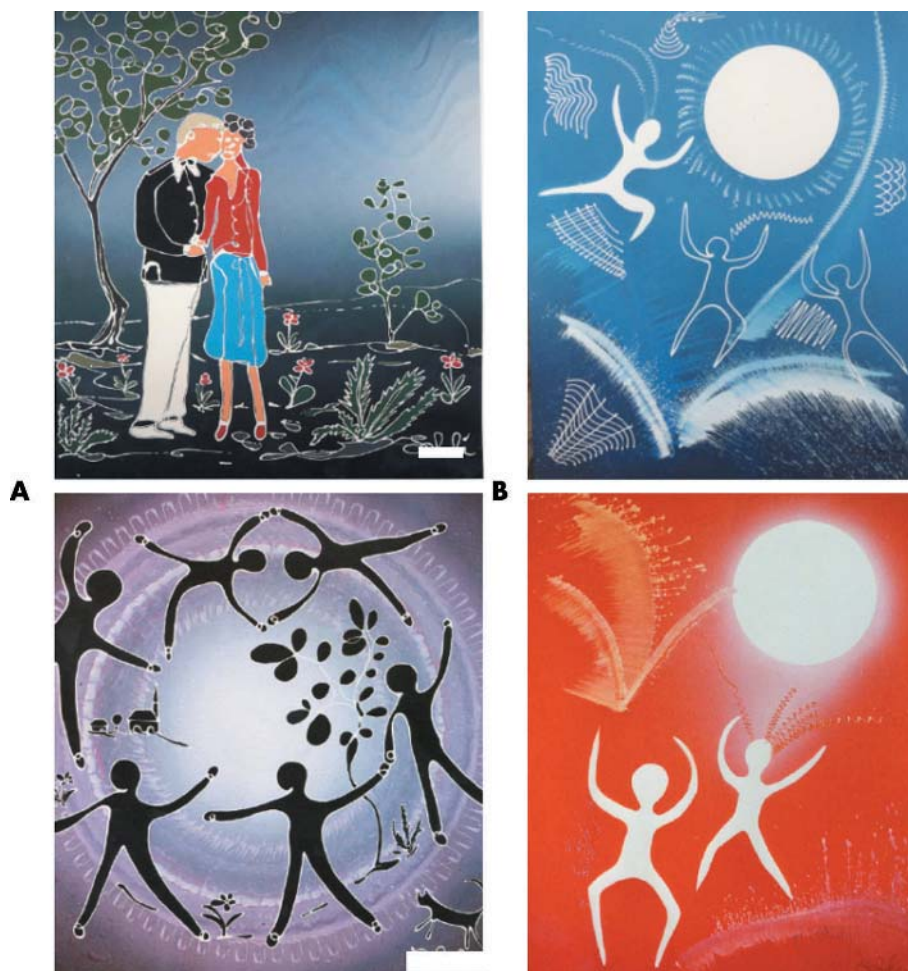
Figure 1 Paintings by patient 1 some months before (A) and 4 months after (B) stroke. The scenes were chosen because of their similarity to highlight the small stylistic changes.