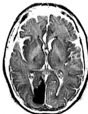
Figure 2 Patient 1’s occipital stroke, as shown in an MRI 3 weeks after the acute event. Fast spin echo T2 (TR: 3800 ms, TE: 90 ms, NEX: 2, FOV: 173×230, matrix: 190×256, 30% gap) 5 mm thick transverse section.

He started drawing and painting 1 month after the stroke and, after a few weeks, comments by relatives and clients made him aware that some changes had occurred in his art. Human limbs and hands were thinner, sharper, and more stylised (fig 1B) and the details simplified. Compared to his