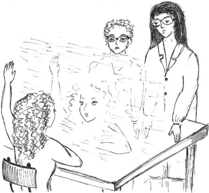
Fig. 2. Graphic representation of the autoscopy hallucination drawn by one of the examiners (G.Z.) following the description by the patient. Note the distance of the image, the perfect correspondence of movements, the apparent left-right reversal attributed to mirrors, the transparency of the image.

respected the apparent left-right reversal attributed to mirrors (Figure 2).