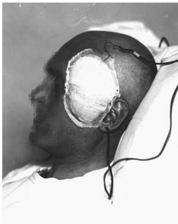
FIG. 2. Patient with the epidural lead and reference electrode on ear lobe positioned for recording. He was monitored for 3 days until enough data were gathered for surgery.

tive area was only partially removed, and no improvement was found on the postoperative EEG (Fig. 3). Immediately after the surgery, the patient did well, but on the first postoperative day, he developed aphasia, and on the second day, epileptic attacks, both focal and generalized. Seizures lasted for 6 days, after which the patient improved, and he was discharged to his home.