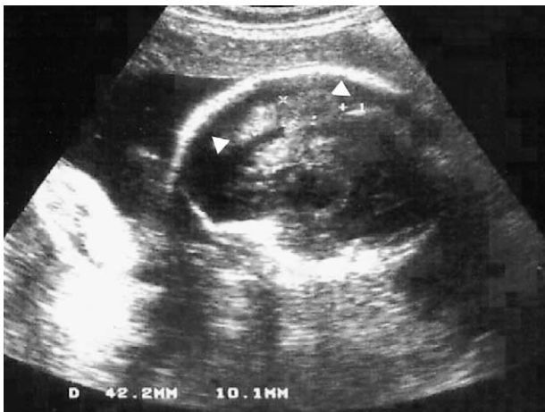
Fig. 2. Cranial ultrasonography performed 3 days later (parasagittal section through the left cerebral hemisphere): periventricular echodensity of 42 \times 10 mm (arrowheads), suggestive of hemorrhagic infarction.

Serum electrolytes, blood glucose, urea, nitrogen, creatinine, liver function tests, ammonia, lactate, pyruvate, aminoacid profile, and TORCH screen were normal. The urinary screening for toxic substances, aminoacids and organic acids did not disclosed abnormalities. On follow-up, a mild right hemiparesis began to appear by the 3rd month,