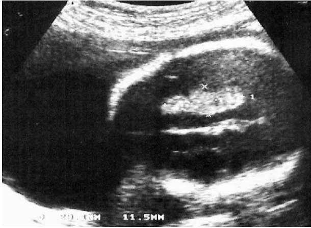
Fig. 1. Cranial ultrasonography at the 28th week of gestation (axial section through the mid-portion of the cerebral hemispheres) the left lateral ventricle is larger than the right one, with an irregular echogenic image of 29 \times 11 mm, compatible with a peri-intraventricular hemorrhage.

the mother, including serological screening for TORCH, were normal. Fetal growth proceeded at a normal rate and the pregnancy continued uneventful until term. A male infant was born at 39 weeks gestation by uncomplicated vaginal delivery. The neonate was in good condition and had no problems following delivery. Apgar scores at 1 and 5 min were, respectively, 9 and 10. The pathologic analysis of the placenta did not reveal abnormalities. Neurological examination and behaviour in the 1st day of life were appropriate for gestational age. The neonate did not show abnormal neurological signs or symptoms during the 1st week of life.