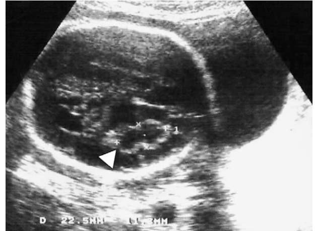
Fig. 3. Cranial ultrasonography 4 weeks after the initial hemorrhage (axial section through the cerebral hemispheres): the previous image has evolved into a cystic cavity in the left frontoparietal area (arrowhead).

and was well established at 6 months of age. At 2 years of age, despite a moderate right hemiparesis, manipulative skills with the left hand were normal. Language development, and social behaviour were adequate for his age. A magnetic resonance imaging scan of the brain showed cystic enlargement of the left lateral ventricle and loss of subcortical white matter (Fig. 4).