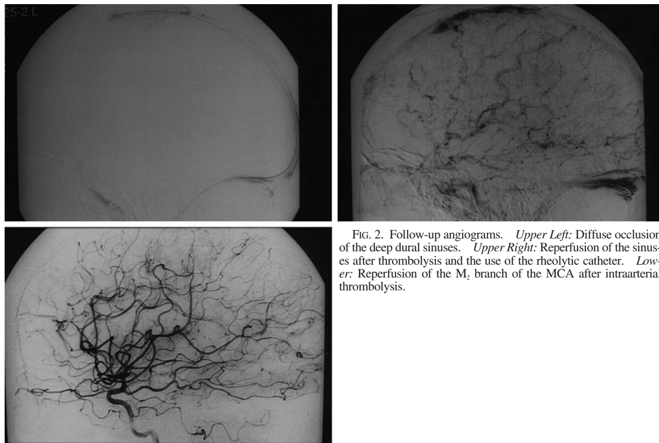
FIG. 2. Follow-up angiograms. Upper Left: Diffuse occlusion of the deep dural sinuses. Upper Right: Reperfusion of the sinuses after thrombolysis and the use of the rheolytic catheter. Lower: Reperfusion of the M 2 branch of the MCA after intraarterial thrombolysis.

the successful use of rheolytic catheters for the management of refractory dural sinus thrombosis. 7