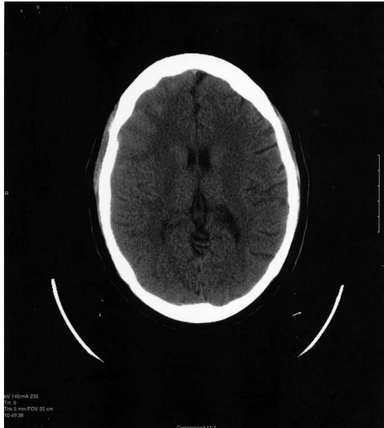
Figure 1. A nonenhanced CT scan of the brain demonstrates loss of cortical sulci in the right frontal, parietal and temporal lobes.

symptoms, there were no other neurologic complaints. She denied any motor weakness or paresthesias.