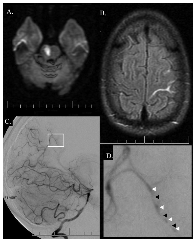
Figure. (A) Diffusion-weighted MR image demonstrating the acute infarct in the upper right pons. (B) Fluid-attenuated inversion recovery MR image showing subarachnoid blood at the convexity. (C) Digital subtraction angiogram right vertebral injection demonstrating areas of narrowing and dilation of distal vessels. (D) Close-up of the area inside the white box in (C). The black-and-white arrowheads indicate the areas of narrowing and dilatation in a posterior cerebral artery branch.

This case highlights the potential relationship between pharmacologically active and widely available “herbal supplements” and cerebral vasculopathy, although we cannot unequivocally prove a connection. The patient’s diabetes, a known vascular risk factor, may have altered his susceptibility to the vasoactive moieties. Physicians and other health care providers should include a detailed history of exposure to herbal preparations including those found in popular soft drinks. Mechanisms for reporting adverse reactions to these products when used as a dietary supplement are evolving; current options include use of the Food and Drug Administration MedWatch Program. Only through aggressive reporting and critical scrutiny will we be able to determine if legitimate public health risks exist from herbal compounds in “energy drinks” and other sources.