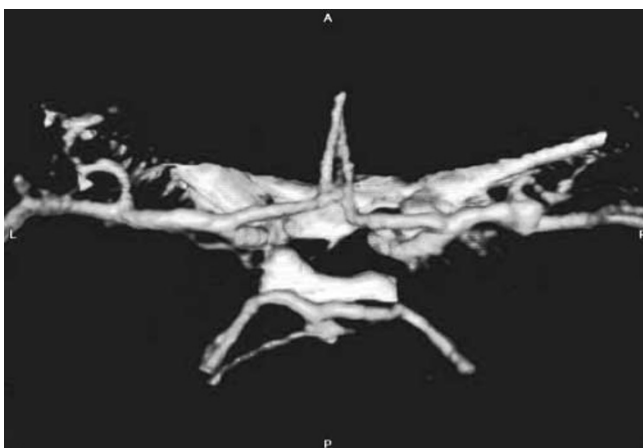
Fig. 1 Aneurysm of 4 mm in diameter located at the level of the right middle cerebral artery bifurcation