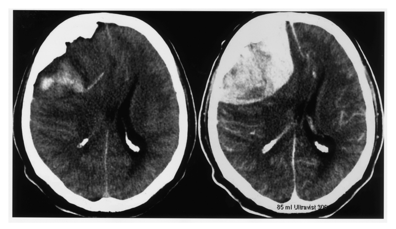
FIG. 1. Unenhanced (left) and enhanced (right) CT demonstrating extra-axial localization, hyperostosis of the adjacent calvarium and intense contrast enhancement of the haemorrhagic right frontal lesion.

Pupils were checked, and found diminished in size and reactive to light.