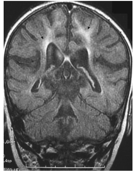
Figure 2: Bilateral hypersignals of the white matter (arrows), particularly in posterior regions (Coronal magnetic resonance imaging, FLAIR).