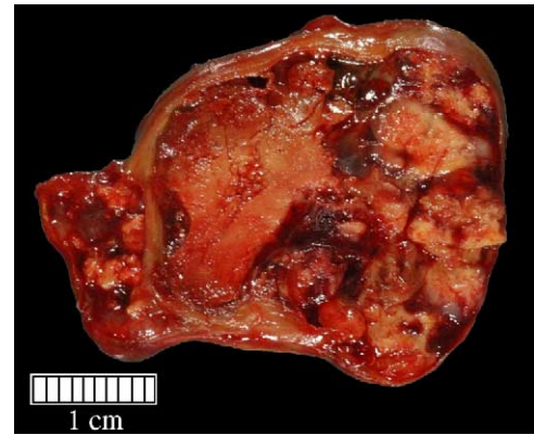
Fig. 2. Cut surface of resected lesion showing relatively smooth fibrous capsule, fibrous septation, and variegated contents of blood clot and pale tumor.

presumptive diagnosis of hemorrhagic left parieto-occipital metastasis or high-grade glioma was made.