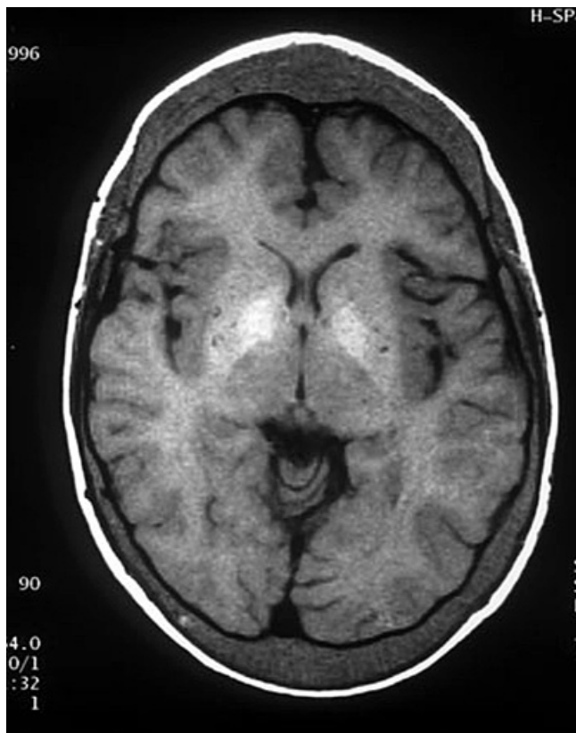
Figure 1. Brain magnetic resonance image showing no infarctions but high signal intensities in bilateral basal ganglia surrounded by multiple small round voids and widening of the diploic spaces of the skull bone ( T_1 -weighted image [repetition time: 560.0 milliseconds; echo time: 14.0 milliseconds]).