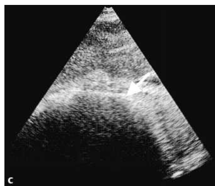
Figure 2 Patient 2. a Computed tomography showed multiple large venous collaterals (arrow) in proximity to the biliary system. b At endoscopic retrograde cholangiography, a fistula (arrow) was seen extending from the bile duct at the proximal edge of the stent into the cavernous vessels; the stent is blocked by a balloon catheter. At the same time, the common hepatic duct is not visualized. c Echocardiography: subcostal view with characteristic pattern of massive air embolism. Note the substantial acoustic shadowing adjacent to the right ventricular free wall (arrow).

try. Under normal circumstances, most air will either be trapped in the liver or in the lung. If the pulmonary capillary filter is overwhelmed by large amounts of insufflated air [5], however, or circumvented via a right-to-left shunt (as occurs with a patent foramen ovale), it is possible for air to pass into the arterial system.