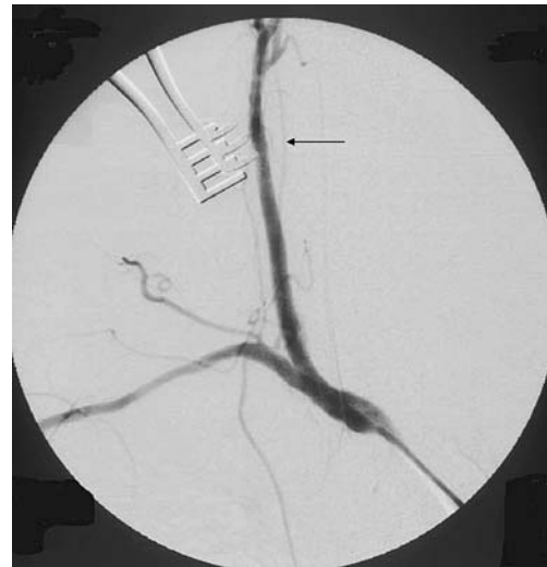
Fig. 4 Postoperative angiography of the innominate artery demonstrating excellent dilatation of the innominate bifurcation and antegrade flow of the right vertebral artery ( arrow )

embolization and plaque displacement. The simultaneous inflation of bilateral artery balloons can avoid these