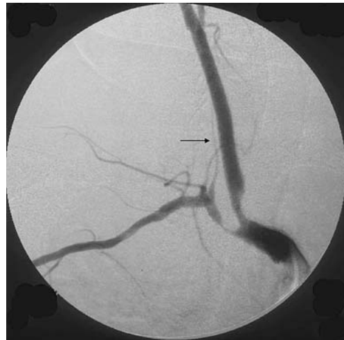
Fig. 2 Preoperative angiography of the innominate artery demonstrating stenosis of the innominate bifurcation. The origin of the right vertebral artery can just be detected ( arrow ), but the distal antegrade flow cannot be detected

8×40 mm compliant PTA balloon catheter was navigated across the stenosis of the common carotid artery via the carotid approach. Balloon angioplasty was performed simultaneously to prevent the shifting of any plaque (Fig. 3a). The balloon catheters were next each exchanged for 8×20 mm and 10×30 mm Easy Wall stents (Boston Scientific Corporation, Natick, Mass.), which were placed simultaneously (Fig. 3b). Postdilations were performed using 8×20 mm and 10×20 mm compliant PTA balloon catheters because residual stenosis was detected (Fig. 3c). Angiography of the innominate artery performed after these procedures revealed excellent dilatation of the innominate bifurcation and a good antegrade flow of the right vertebral artery (Fig. 4). The sheath placed in the carotid artery was removed and the pooled blood and debris were flushed out via the arteriotomy. The arteriotomy site was closed by suturing with 6-0 nylon. Thereafter, the other sheaths were removed. Heparinization was discontinued immediately but was not reversed.