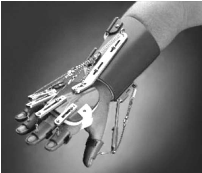
Figure 1. The Saeboflex ® dynamic UE orthosis worn by the patient during training.

of shoulder movements. Typically the patient stood during these repetitive practice sessions using the orthosis.