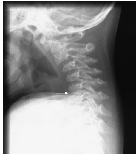
Figure 1 An x ray of the lateral cervical spine showed disc calcification at C5/C6 (arrow) with no evidence of a herniated disc.