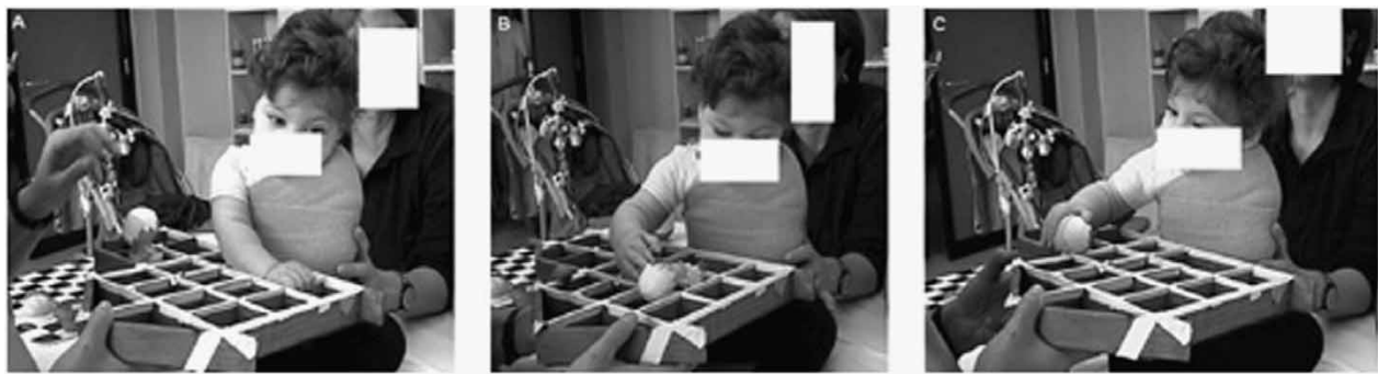
Figure 4. Note the tactile background containing a coloured toy. The context is set up on the right side. (A) The child does not activate reaching/grasping in the right hemisphere. (B) He activates reaching/grasping when the toy is shifted near the midline. The background is used as a tactile guide to facilitate reaching/grasping. (C) He also activates reaching/grasping in right-sided sectors after experimenting with tactile guide near the midline.

checkerboard, measuring 100 \times 100 cm, with high colour contrast and 5 \times 5 cm squares (Figure 3). The tactile background was a wood or plastic board consisting of a showcase (space broken up into sections) containing objects located on a horizontal or vertical surfaces. Boards had from 9 to 17 holes located at a distance of 0.5–2 cm from each other, arranged in several horizontal rows and columns (Figure 4). The boards had three different sizes of holes: 7 \times 5 , 9 \times 7 , 18 \times 10 cm. The organization of space on this tactile background helped the child in reaching and grasping an object with his hand, using visuo-tactile exploration. The objects, placed either on the checkerboard or inside the showcase, had a multisensory stimulation role (visual + auditory + tactile information: e.g., a squeezable coloured rubber animal in contact with the child's hand or face producing a sound).