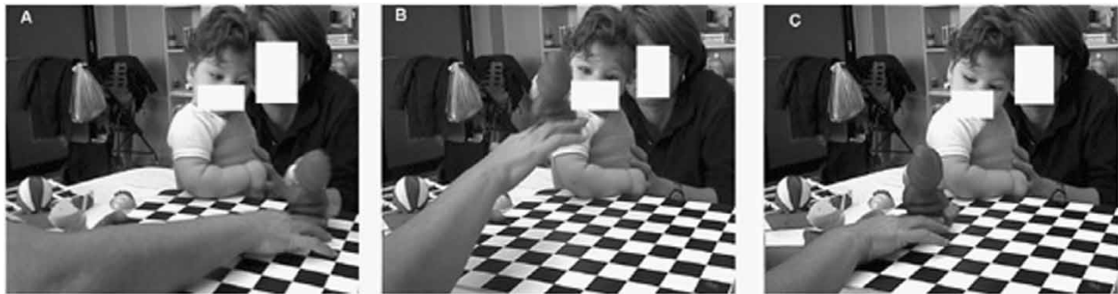
Figure 3. Note the visual background has a coloured toy on it. The context is set up on the right side. (A) The child gazes at the toy. (B) He tracks the toy that is moving away from the midline. (C) He holds his gaze on the toy at 90° from the midline.