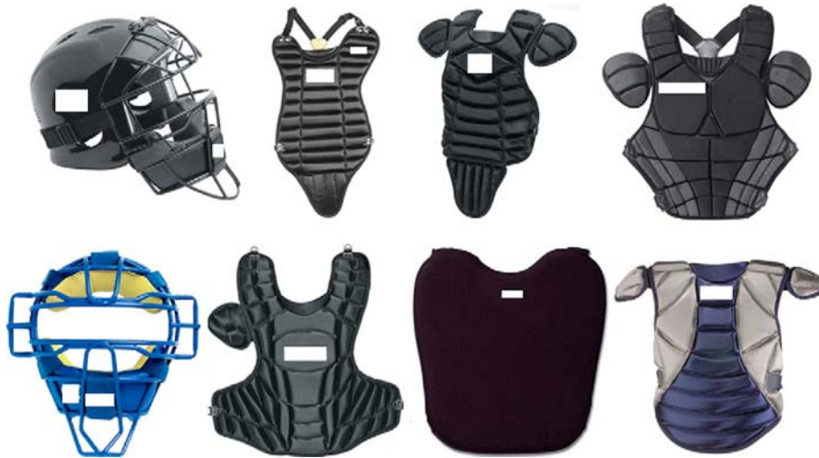
Fig. 3. Examples of umpire and catcher protective equipment. The midline neck is protected. Exposure of the lateral neck places the carotid artery at risk for blunt injury.

of the chest protector, laterally, would afford greater protection to the area where the extracranial carotid artery travels, preventing type I injury. A device limiting head extension could prevent type II injury.