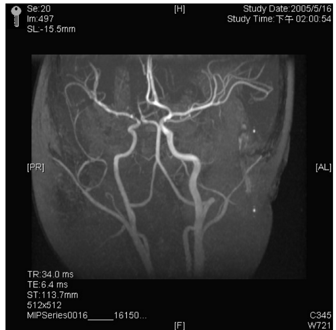
FIGURE 3. Magnetic resonance angiography showed relative small caliber of right ICA as compared with the left. Focal narrowing of right ICA at petrosal segment and communicating segments. Right A1 segment is patent, but blood flow arose from left ICA circulation via anterior communicating artery.

injuries after blunt cervical trauma, in descending order of incidence, are as follows: dissection, pseudoaneurysm, and thrombosis. 3,4 The dissection of carotid artery usually begins just above the carotid bifurcation and extends toward the foramen lacerum. 5 In our patient, MRA and cerebral angiography showed focal narrowing of right ICA at petrosal segment and communicating segments.