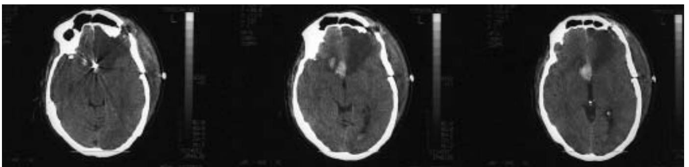
Fig. 1. CT scan images performed 10 days post-surgery demonstrate evidence of left frontal craniotomy. There is a large acute infarction within the left frontal lobe, including both dorsolateral and ventromedial prefrontal cortex. In addition, there is a smaller haematoma within the posterior aspect of the right frontal lobe and a small residual haematoma in the depth of the anterior interhemispheric fissure/septum pellucidum. Residual subarachnoid blood is noted within the mid line frontal sulci and over the convexity mainly on the left. There is soft tissue swelling within the scalp tissues overlying the left frontal craniotomy.

LH's performance of standardised neuropsychological tests is summarised in Tables 1 and 2. His IQ appeared moderately deteriorated, while his verbal and visual anterograde memory showed marked deterioration. LH made a few intrusions, mainly in the delayed recall of auditory tests. His recollection