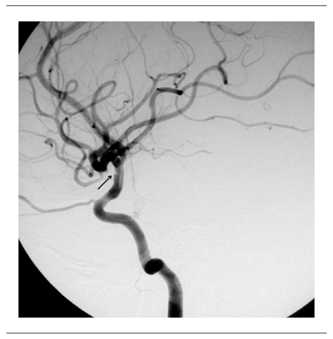
Figure 3. Cerebral angiography (oblique projection) shows the left internal carotid artery and terminal branches, with focal irregularity in the lumen of the terminal internal carotid artery (arrow).

discharged to home 3 weeks later with aspirin therapy. At discharge, she was able to speak normally and walk without support (mildly spastic gait). She was also able to raise the right arm up to the level of the shoulder and showed increased motility of the hand and fingers, then being able to grab objects (a ball, a pen) without help.