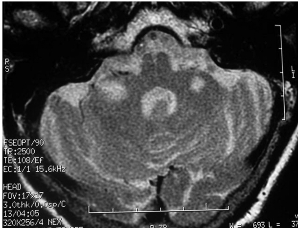
Fig 1. Contrast-enhanced magnetic resonance image of brain shows 2 fresh infarctions symmetrically localized in posterolateral bulbopontine junction.

tensity (125 dB sound pressure level) were absent. An electrocochleogram demonstrated bilateral normal cochlear potentials, and the compound action potential of the nerve was absent.