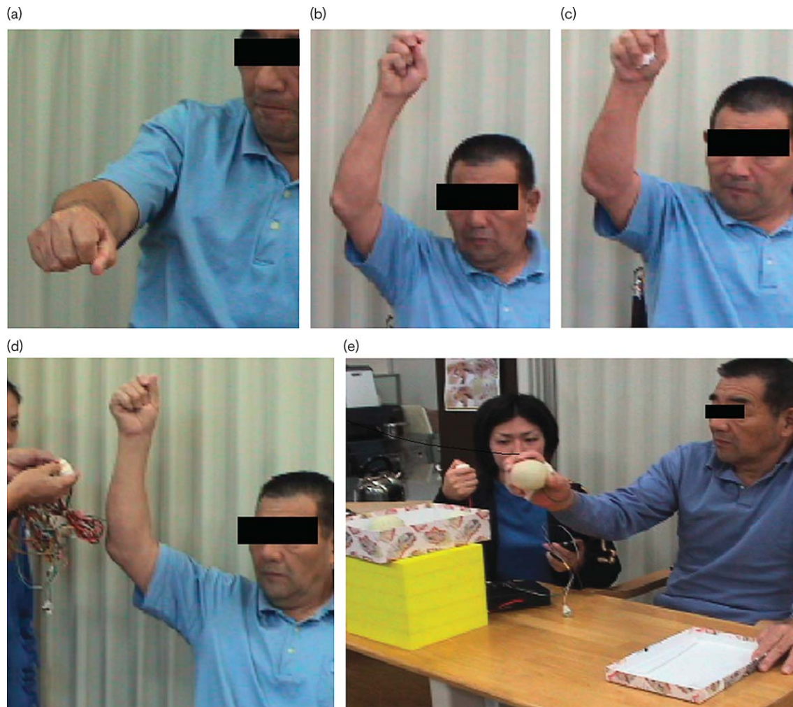
Improvements of the patient's shoulder flexion by vibratory stimulation to the palm. (a) He could not raise his right arm more than 70° when he held nothing in his right palm. (b) and (c) He could raise his right arm by more than 135°, but only when he had a block and a soft paper ball in his right palm. (d) He could raise his hand with a vibratory stimulation to his palm. (e) He held a ball before his chest and carried it to a high and distant point; this action necessitated flexion of the shoulder, reaching, releasing objects and withdrawing to the starting point when functional vibratory stimulation was delivered to his right palm.

measurement of F-waves in the patient was carried out with the patient at rest, when being stimulated by FVS, and after stimulation. No changes in F-waves resulting in an improvement of shoulder flexion were found.