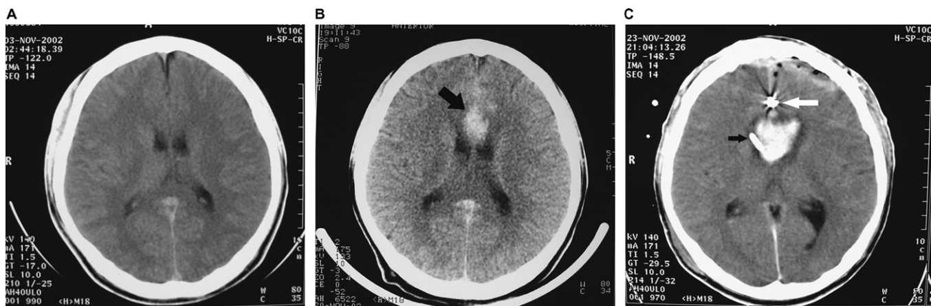
Fig. 1. CT scan of head. (A) 17 days prior to admission reveals no hematoma. (B) Pre-operatively reveals the hematoma (black arrow) in the falx region. (C) Post-operatively reveals the aneurysm clip (white arrow) and shunt tip (black arrow) in the right lateral ventricle.

complained of headache and dizziness. Upon arrival at the emergency room, his Glasgow Coma Scale score (GCS) was 12. Multiple abrasions over the face and fracture of