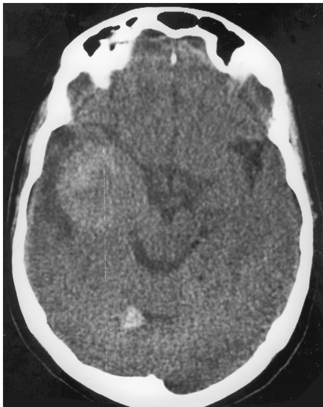
FIGURE 1. Diagnostic images of patient. Cranial CT show hyperdense lesions in the right temporal, right parietal, and left frontal lobar areas.

hemorrhagic lobar hyperintense-hypointense mixed lesions on T2 and FLAIR-weighted images and hyperintense lesions on T1-weighted images in the right temporal (2.3 cm in diameter), right parietal (1.6 cm in diameter), and left frontal (1.2 cm in diameter) areas, which were not contrast-enhancing. The right temporal region is surrounded by edema (Figs. 2–4). Intracranial MR angiography was normal. Thus cerebral cavernomatosis was considered in the differential diagnosis. The patient was treated with levetiracetam 1000 mg/d and seizures were controlled. She was discharged from hospital because surgeons were conservative about operating on her finding it risky due to her previous history of liver transplantation. Moreover, because the result her neurologic examination was normal and hemorrhagic lesion was limited, surgery was not thought to be crucial.