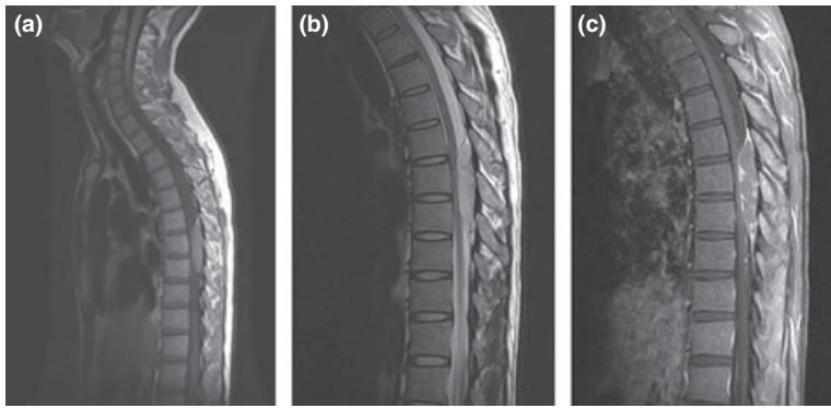
Fig. 1. Magnetic resonance imaging of thoracic spine performed 9 h after onset of symptoms. (a) Sagittal T1-weighted image. (b) Sagittal T2-weighted image. (c) Sagittal T1-weighted image with contrast. Note an extradural fusiform mass, 1.6 \times 1.3 \times 5.9 cm, causing spinal cord compression.