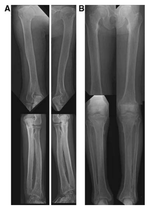
Fig. 3 Standard X-rays of the long bones of the upper (a) and lower (b) extremities. Proliferative periosteum is seen in every bone