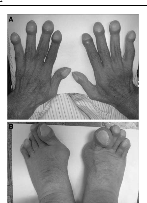
Fig. 1 The patient's hands (a) and feet (b). All fingers and toes show extreme clubbing. Both feet have a hallux valgus deformity

normal ranges. The patient had a mildly elevated alkaline phosphatase (414 mg/dl; normal, 102–302). Total cholesterol (107 mg/dl; normal, 130–220) and high-density-lipid cholesterol (30 mg/dl; normal, 35–100) were low, and triglyceride (111 mg/dl; 30–150) was within the normal range.