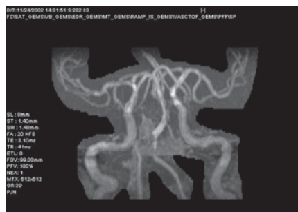
Fig. 2. MRA. Within the basilar artery, there are two areas of narrowing, with mild narrowing in the proximal-basilar artery and approximately 50% narrowing in the mid-basilar artery.