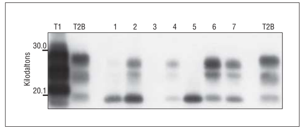
Figure 3. Detection of the proteinase K-resistant form of the prion protein (PrP) by Western blot. Lanes 1 through 7, respectively, are the frontal isocortex, thalamus, cerebellum, pulvinar, occipital isocortex, hippocampus, and caudate nucleus from the patient with familial fatal insomnia. T1 indicates control sample with PrP type 1; T2B, control sample with PrP type 2B.

in a patient with a short duration of the disease is consistent with previous postmortem studies, reports that used [18F]2-fluoro-2-deoxy-D-glucose positron emission tomography that showed a more widespread cerebral involvement in patients with fatal familial insomnia with prolonged disease only (>18 months).<sup>6,12-14</sup> In correlative studies, while brain hypometabolism was more widespread than histopathologic changes, all areas that showed detectable lesions (neuronal loss and astrogliosis) were also hypometabolic.<sup>6,14</sup>