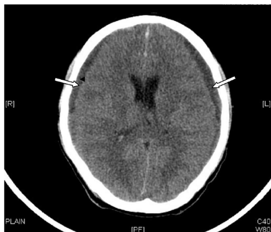
Figure 3 Plain computed tomography (CT) scan of the head showing bilateral subdural haematomas (marked by white arrows).

pancreatitis and adult respiratory distress syndrome in association with malaria [11]. This young man did not manifest acute respiratory distress syndrome either with severe malaria or with acute pancreatitis.