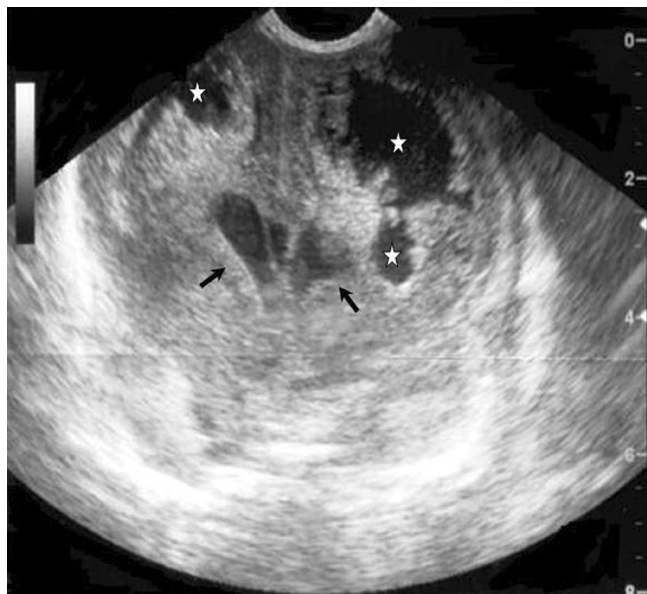
Figure 1. Coronal cranial ultrasonography images reveal dilated lateral ventricles and periventricular cysts. White star, cystic encephalomalacia; black arrow, dilated lateral ventricles.