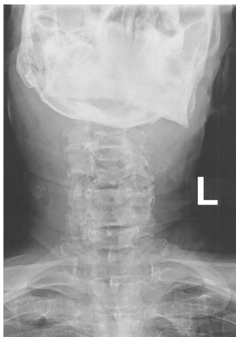
Fig. 1. Anteroposterior radiograph of the neck showing acute tilting of the head over the upper neck with resorption of the occipito-atlantal articulation and part of the C1 vertebra on the left.

Two months into his rehabilitation, he presented again to our community hospital when his neck pain significantly increased and after developing severe torticollis with a peculiar rotatory head tilt. X-rays of the neck (Fig. 1) showed acute tilting of the head over the upper neck with resorption of the occipito-atlantal articulation and part of the C1 vertebra on the left. Computed tomography scan of the head and neck (Fig. 2) revealed no acute infarct with chronic small vessel ischemic changes, destruction of C1 anterior arch, odontoid tip and clivus, and severe degenerative changes extending to the level of C7. Magnetic resonance imaging (MRI) of the head and neck (Fig. 3) revealed the extent of the infectious process, which encompassed the skull base foramen for these cranial nerves on the left side,