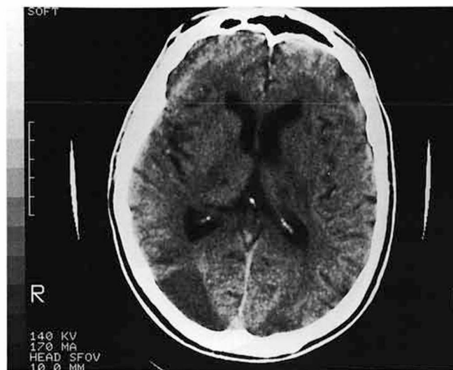
Fig. 2. CT 48 days after the first signs and 14 days after the first CT showed well circumscribed lesions of both occipital branches of the occipital lobes, more on the right side, with sparing of the visual cortex bilaterally and with symmetrical lacunar infarctions in the lateral parts of both thalami.

infarctions of the occipital lobes restricted to the top of the lobes (fig. 1). The patient's condition deteriorated further with disturbances of consciousness, persistent agitation with screaming and yelling and a paresis (3/5) of the right arm and leg. A control CT 11 days after onset disclosed more extensive hypodensities in both occipital (occipital and calcarinal) lobes and in the left temporal branches. She died 17 days after onset of the first neuropsychological signs. Examination of the brain demonstrated infarctions of the occipitotemporal lobes on the left side and occipitobasal infarctions on the right. There were confluent necrotic foci in the medial part of the pulvinar with infiltration of foam cells and necrotic foci near the central tegmental tract. The occipitobasal infarctions were above all subcortical and irregular, with pycnotic nuclei and cortical spongiosis. The findings were compatible with multiple embolic infarctions. Examination of the heart revealed an old posterior infarction in the lower one-third of the left ventricle, without mural thrombus.