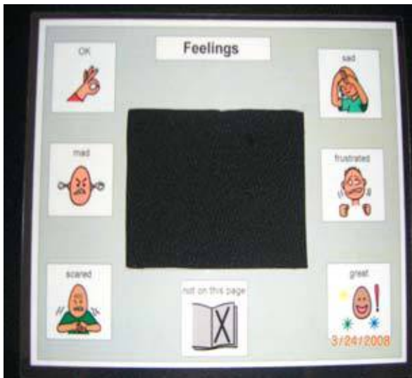
Figure 1. Communication using PCS symbols with word labels via vertical eye gaze in a field of two, and an example of an eye gaze communication board with PCS symbols. The listener holds up the board and looks through the middle hole to watch the eyes of the communicator.