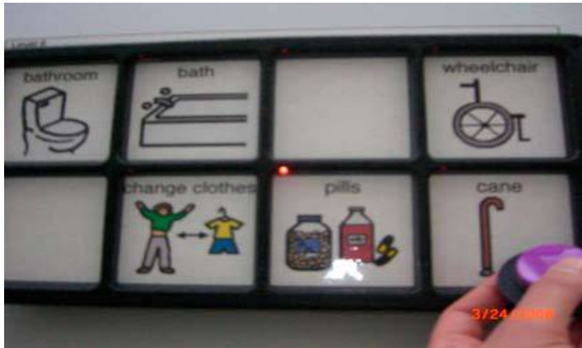
Figure 3. Amdi recordable speech device used in linear scanning mode with auditory feedback. Switch seen on bottom right can be placed at the patient’s knee, head, shoulder, or other locations if hand function is impaired.

of a motivating activity, communication of needs/wants, or for choice making.