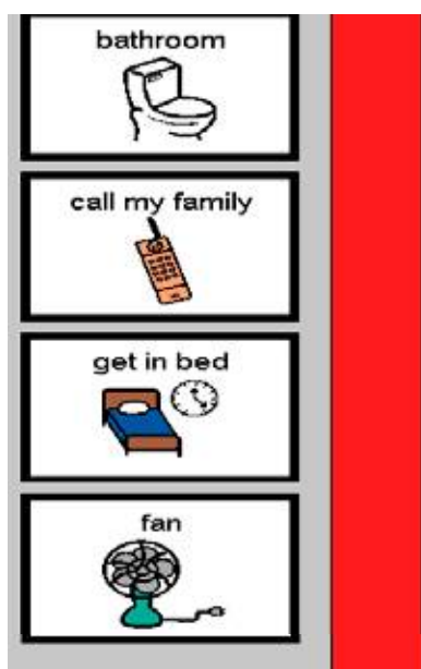
Figure 2. Example of a communication board with PCS symbols for a person with right inattention.