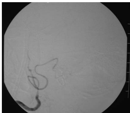
Fig. 5 Control digital subtraction angiography demonstrated no aneurysmatic fillings.

tonsillomedullar, telovelotonsillar and cortical segments [10]. Distal PICA aneurysms are particularly rare. It is reported that their observation rate is about 0.28–1.4% among all cerebral aneurysms [1]. The VA-originated aneurysms appear in the PICA in 80% and usually in the VA-PICA division point. And this rate is lower in the distal area. 15–30% of all PICA aneurysms are seen in the distal part and especially in the peripheral PICA segments [2]. Although in some series, the distal segment PICA aneurysm incidence is higher in the telovelotonsillar and tonsillomedullar segments [1], it is reported that, in a 16-case-series which comprises 18 aneurysms, the incidence is higher in the anterior medullar segment [11]. It is thought that hemodynamic stress and congenital factors play role in the occurrence of distal PICA aneurysms [12].