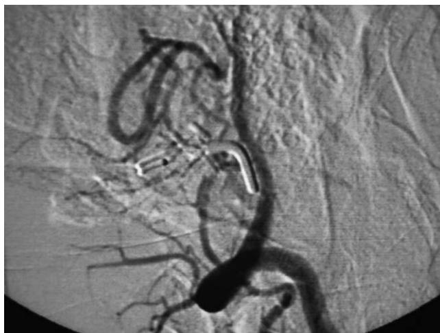
Fig. 3 Control digital subtraction angiography demonstrated no aneurysmatic fillings.