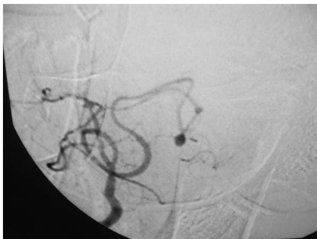
Fig. 4 Digital subtraction angiography after one month from the first bleeding demonstrated two small aneurysmatic fillings located at the right PICA distal segment.