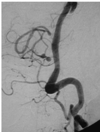
Fig. 2 Two small saccular aneurysms were demonstrated on the digital subtraction angiography.