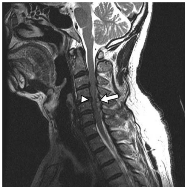
Fig. 1 Sagittal T2-weighted cervical magnetic resonance image shows a longitudinal posterior epidural hematoma from C4 to C5 (arrow), compressing the spinal cord (arrowhead)

The initial manifestation of SSEDH is non-specific and is easily misdiagnosed [1, 5–8]. In our case, the initial presentation with acute right side hemi-paresis and high blood pressure misled the attending ER physician to suspect a cerebral stroke. These signs led the clinical evaluation to