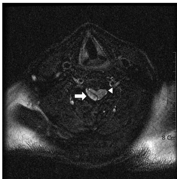
Fig. 2 Axial T2-weighted cervical magnetic resonance image shows an ovoid epidural hematoma (arrow) in the right postero-lateral aspect and spinal cord compression (arrowhead)

focus on the prominent paresis of the patient's arm and leg, and on the neck pain, without searching for other neurological signs. For example, the fact that the patient's face was spared and no specific brain stroke symptoms such as dysarthria, cranial nerve malfunction was not taken into consideration. We emphasize that when a patient has