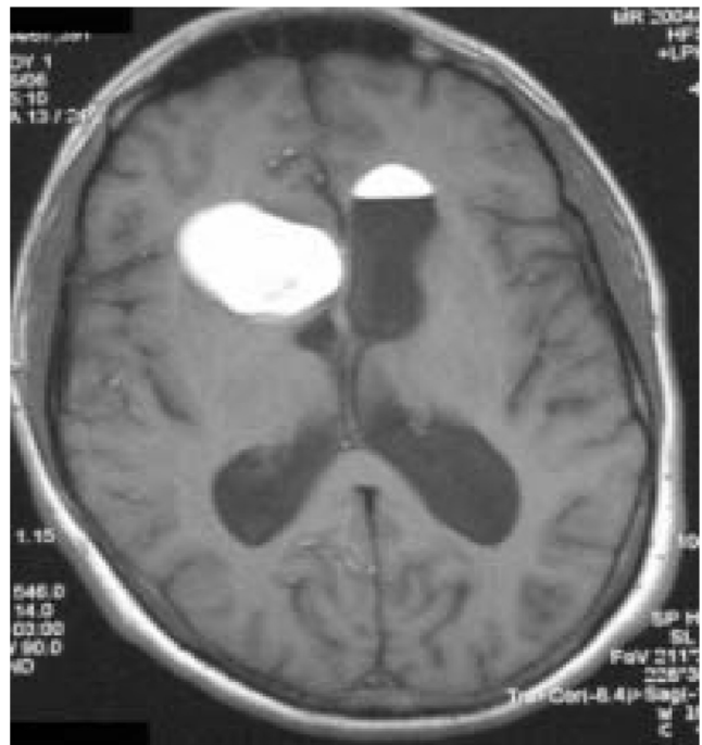
FIGURE 1 Preoperative axial T1-weighted MRI slice revealing the right frontotemporal dermoid cyst, fat-fluid level in the contralateral ventricle and diffuse subarachnoid dissemination of fat droplets notably in the right frontal lobe.

Prior to surgery a neuropsychological assessment was requested. See Table 1 for psychometric data. The results revealed impairment of verbal recall and learning, impairment of nonverbal recall, spared nonverbal learning, reduced verbal fluency, and poor divided attention. Problem solving, naming, and visual attention were spared. A short immediate-attention span also emerged. During the operation, after induction with propofol, general anesthesia was maintained by propofol and isoflurane. These anesthetic agents are standardly employed in neurosurgical operations, having value in terms of neuroprotection and a minimal side effect profile regarding memory and cognition (Yurdakoc et al., 2008; Becker et al., 2006; Wang et al., 2002). A right subfrontal craniotomy was performed and the cyst was found to be adherent to the right optic nerve and both anterior cerebral arteries. Dissection resulted in further rupture of the cyst and spillage of the dermoid fluid contents, prompting immediate and copious washout with normal saline with hydrocortisone. Complete resection of the