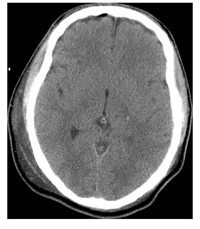
Figure 2. Computed Tomography (CT) axial scan without contrast performed on the 24 hours following injury showing a small haemorrhage in the left postero-lateral left thalamus.