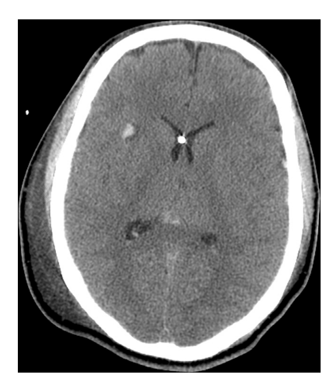
Figure 1. Computed Tomography (CT) axial scan without contrast performed on the 24 hours following injury showing a small haemorrhage in the right basal ganglia.

A follow-up CT scan 2 months after injury showed significant decrease in the size of subdural collections measuring \sim 3 mm in depth on the right side and almost complete resolution on the left side. Intraparenchymal abnormalities shown on MRI could not be visualized on the CT. He was seen for neuropsychological assessment ~3 months following the initial injury.