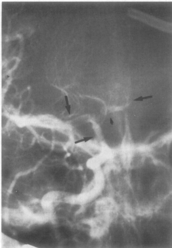
Fig. 1. Case 1. Anteroposterior angiogram of right common carotid artery shows supraclinoid internal carotid ( lowermost arrow ) with poor filling. Intraluminal clot seen as filling defect with marginal opacification (tram-track sign) in proximal portion of right middle cerebral artery ( right arrow ). Origin of right anterior cerebral artery occluded by same clot, whose distal extent is shown in first arterial segment ( small arrow ). Additional filling defect (embolus) in proximal anterior pericallosal artery is present ( left arrow ).

mandibular fractures of the angle and subcondylar areas were also evident. No other systemic injuries besides lacerations of the right hand and knee were present. The patient neurologically had a Glasgow coma score of 8, anisocoria with a 3 mm right reactive pupil and a 4 mm unreactive left pupil, and a left peripheral partial seventh nerve paresis. She moved all four extremities spontaneously and responded to painful stimuli.