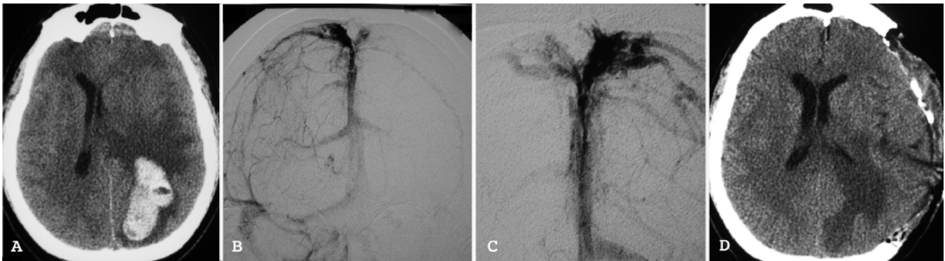
FIG. 2. Case 2. A: Preoperative CT revealing a hemorrhagic infarction of the left parietal lobe with brain swelling and midline shift. B and C: Late-phase right (B) and left (C) internal carotid artery digital subtraction angiograms in frontal projection, demonstrating stagnation of the contrast medium in the frontoparietal ascending veins and no opacification of the superior sagittal sinus. D: Postoperative CT scan of the brain.

comatose with an abnormal flexion response to pain and a dilated pupil on the left side.