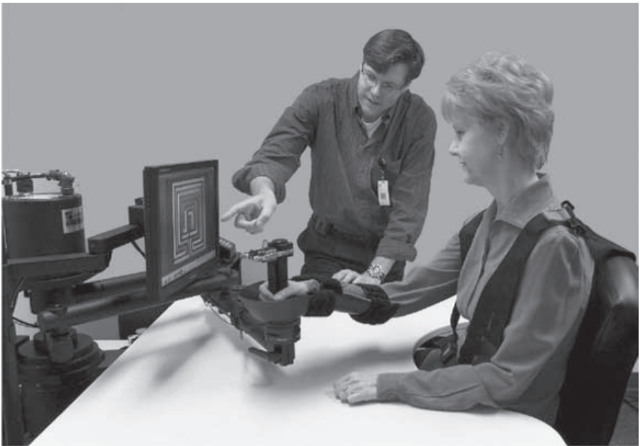
FIGURE 1: Photo of registered occupational therapist explaining the InMotion2 treatment module to a staff member.

In 2005, this facility chose the InMotion2 robot by Interactive Motion Technologies, Inc. because of the studies suggesting efficacy in stroke recovery at that time (Volpe et al., 1999, 2003; Fasoli et al., 2003, 2004; Ferraro et al., 2003), and because it was a commercially available product. A picture of the robot in use can be seen in Figure 1.