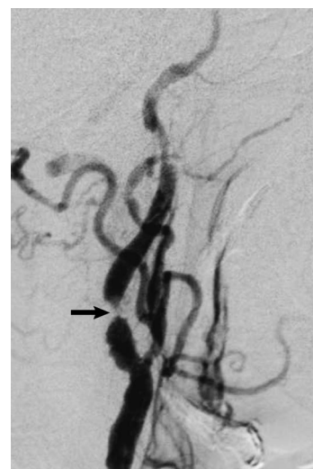
Fig. 2 Right common carotid angiogram showing severe stenosis (arrow) in the origin of the right internal carotid artery.