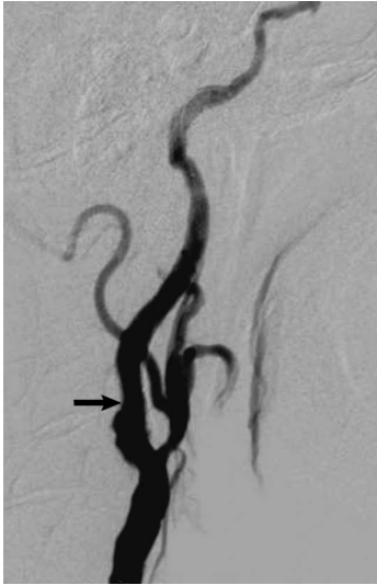
Fig. 5 Right common carotid angiogram showing the stenosis in the internal carotid artery adequately dilated (arrow).

guidewire. 7,9,11 ) However, in the present case, the angioplasty and stenting devices had to be delivered separately into the ICA from the guidewire placed for the pull-through method through the ECA. A guiding catheter with a large diameter would be required to deliver both the pull-through guidewire and the therapeutic devices. Recently, a case of stenosis in the left vertebral artery origin was successfully treated by stent placement using the brachio-brachial pull-through method. 10 An 8F guiding catheter was introduced into the left subclavian artery from the right brachial artery over the pull-through system between the bilateral brachial arteries, and devices were delivered for distal protection, angioplasty, and stenting into the left vertebral artery, as well as the guidewire used for pull-through method through the 8F guiding catheter. No hemodynamic events occurred in the forearm despite the use of the guiding catheter with a relatively large diameter. 10 However, use of the smallest guiding system possible will reduce the possibility of complications at the puncture site including insufficient blood flow in the forearm. 4,5,12 )