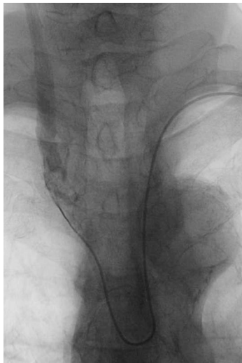
Fig. 1 Angiogram via the left brachial artery showing the right innominate artery branching at an acute angle from the aorta, and tip of the diagnostic catheter placed just in the orifice of the right common carotid artery.

particularly difficult because of the very tortuous access route. Accordingly, we devised a pull-through technique between the left brachial artery and the right STA to achieve smooth and safe catheterization.